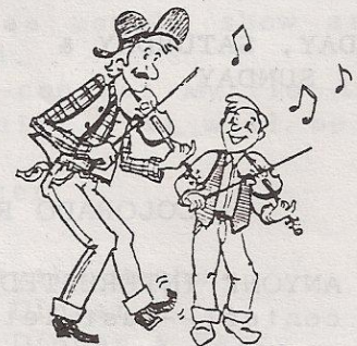
You don't have to be old to be an old time fiddler.

GOING NORTH TO SKI OR CURL ALL HER DAYS ARE IN A WHIRL NOTHING SEEMS TO STOP OR BLICK HER NOW THAT GRANDMA'S OFF HER ROCKER