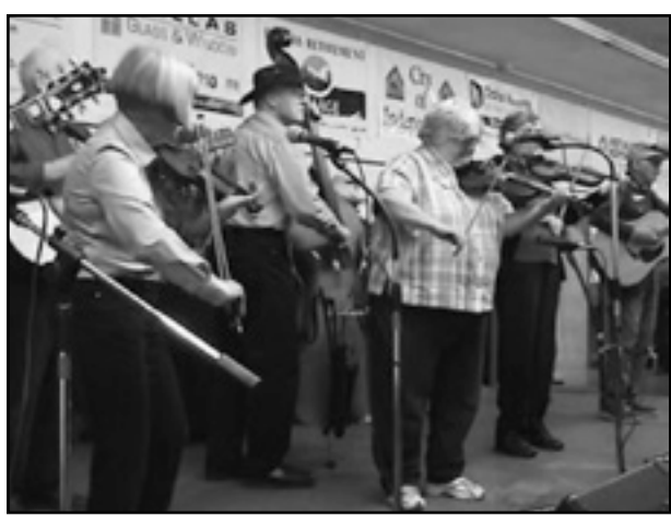
April 2010 OOTFA Convention