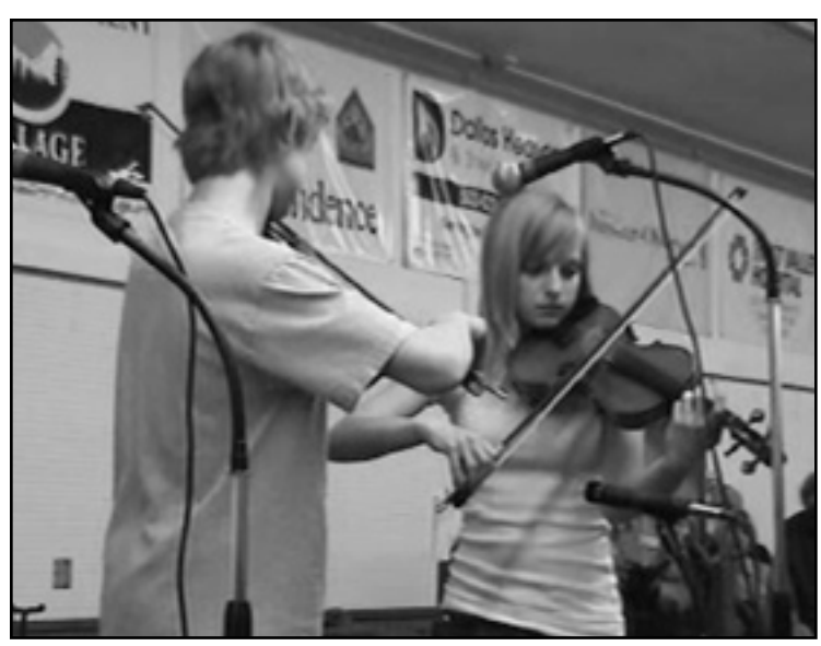
April 2010 OOTFA Convention