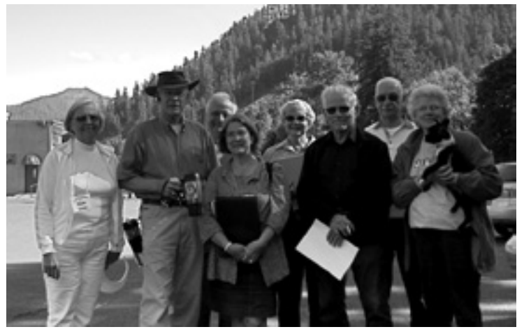
Above: West Cascades Fiddle Camp Committee