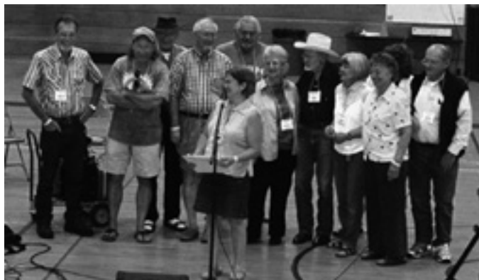
Above: Instructors, West Cascades Fiddle Camp