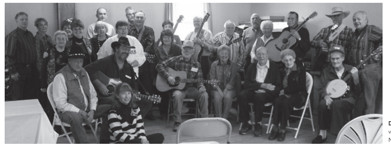
District 1 - Wishing everyone a very Merry Christmas and a Happy New Year