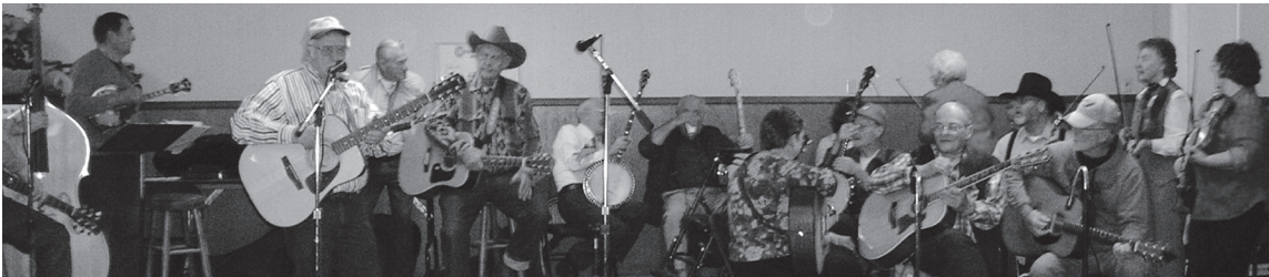
Left: District 1 musicians at the Sunday dance.