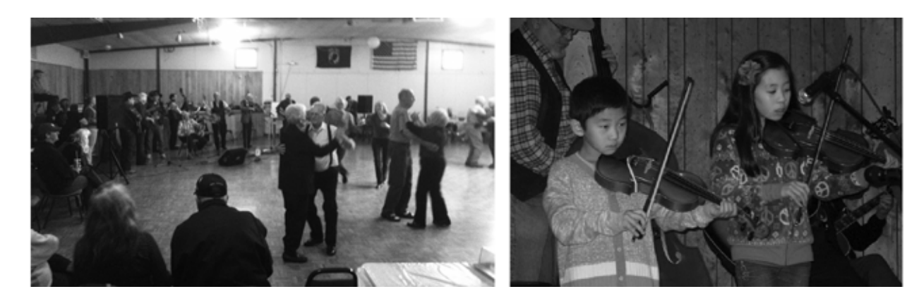
Left (this page): District 3 dancers.