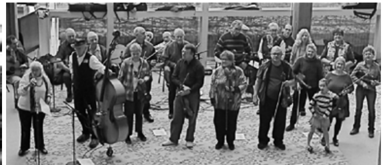
Above: District 6 Plays at the Hult Center in Eugene