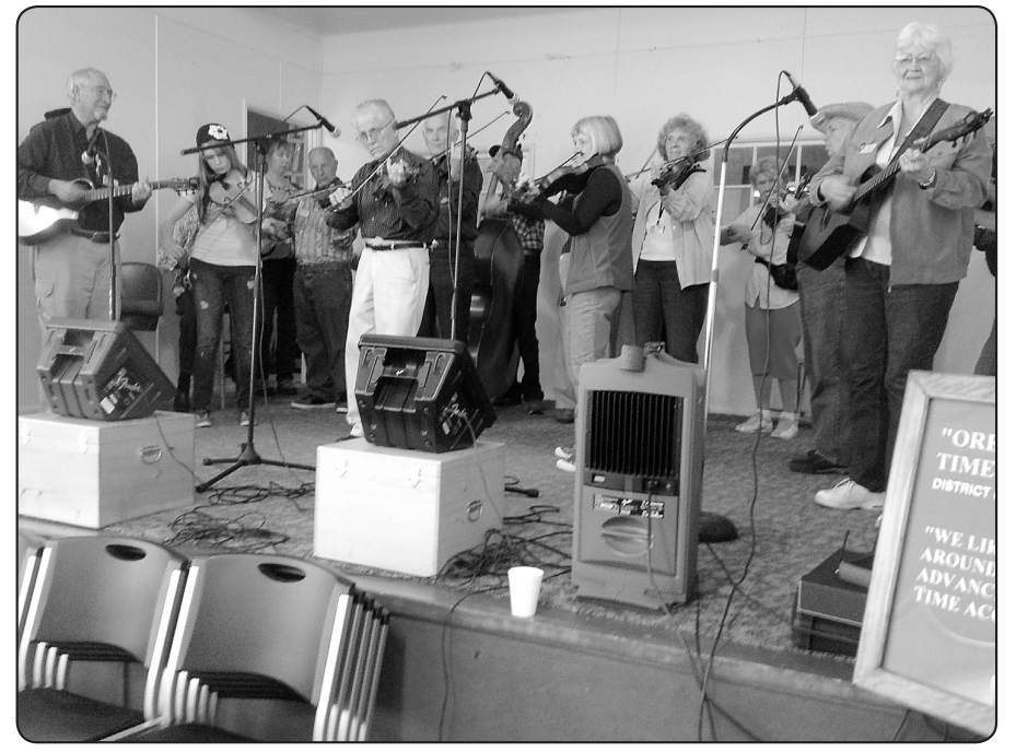
On stage at Winchester Bay