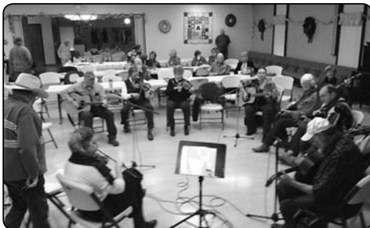
District 3 members jamming at the Christmas party.