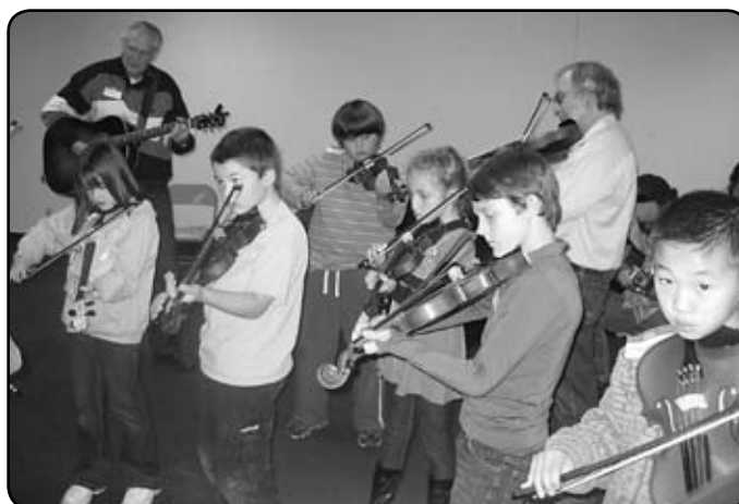
District 4 junior fiddlers sound off!