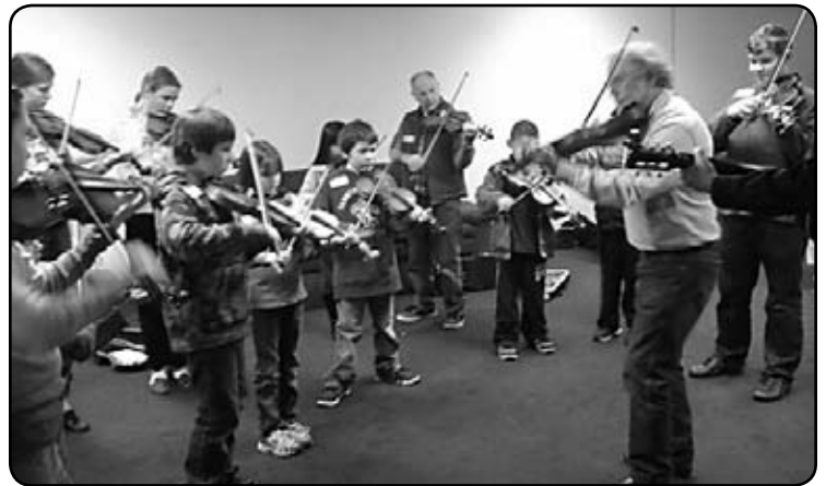
The District 4 beginning fiddle class.

It's such a joy to work with these young folks and watch them grow in not only musical ability, but self-confidence and stage presence! We have a great bunch of students!