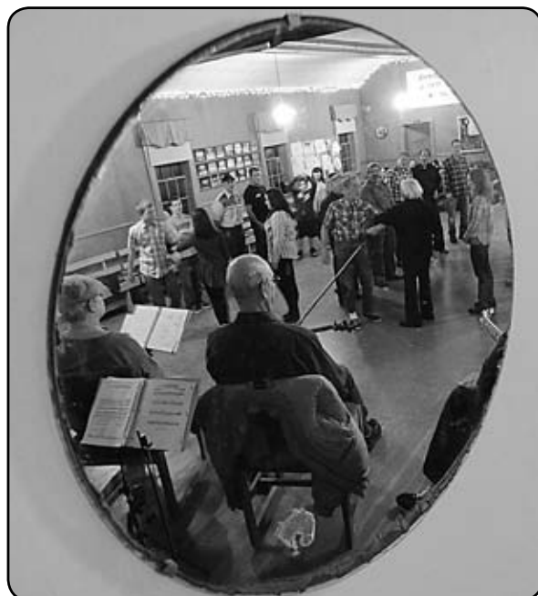
Seen in a mirror: District 6 Barn Dance