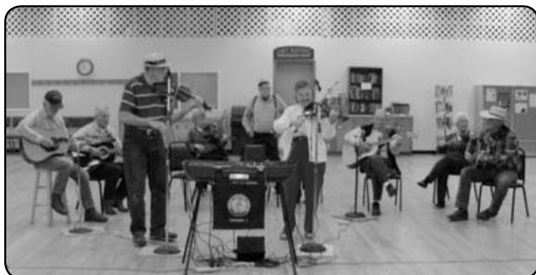
District 1, at the Senior Center