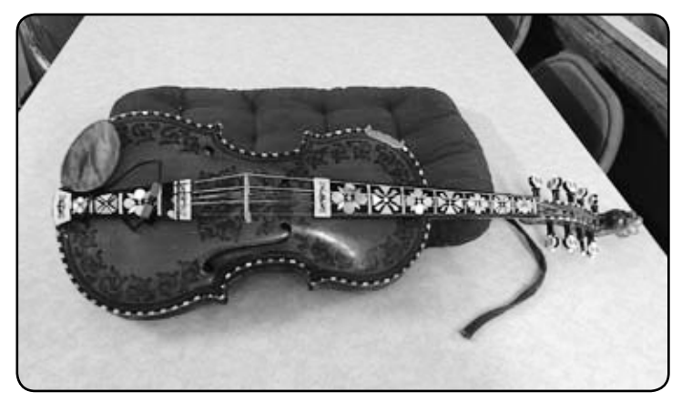
A Hardanger fiddle.