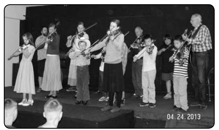
District 4's fiddle class final program for friends and family.