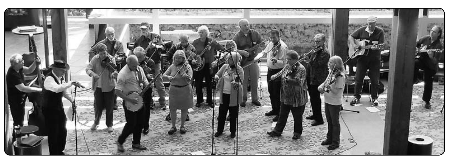
District 6 performs at the Hult in Eugene on May 2