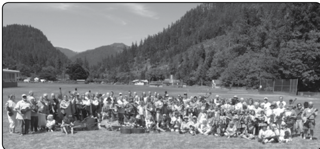
Everyone Assembled at the 2013 West Cascades Fiddle Camp.