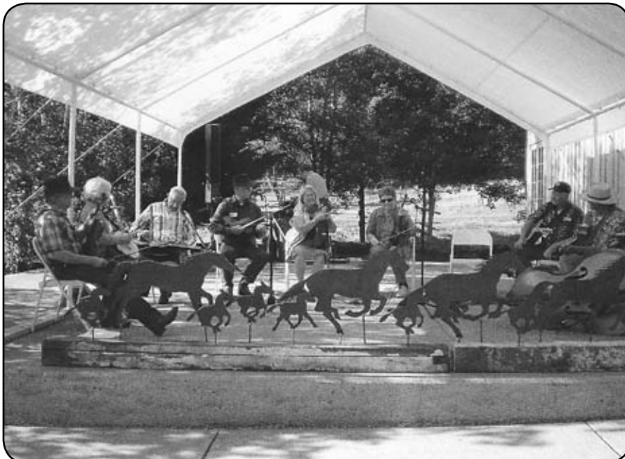
District 6ers at the Opera gig.