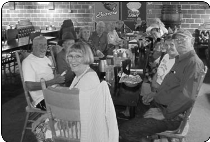
District 8ers at dinner after their annual Mount Angel jam.