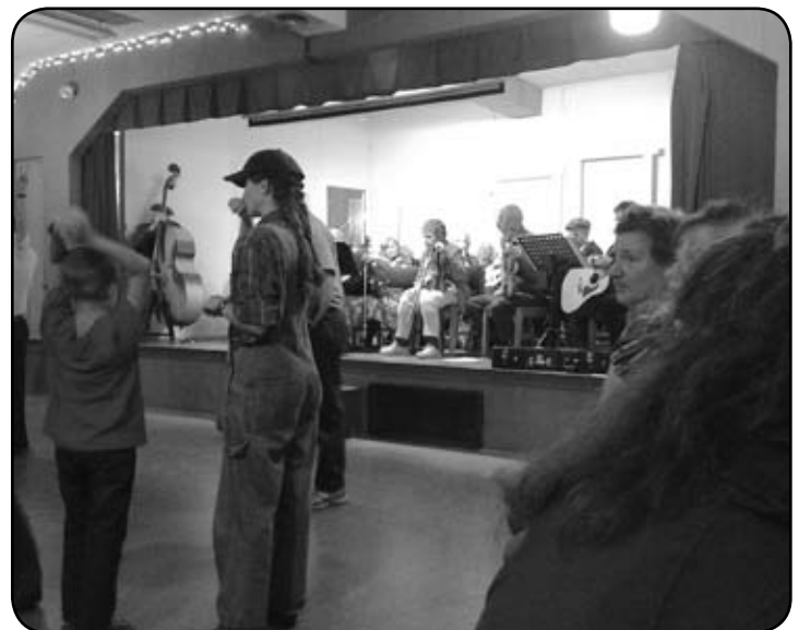
District 6 players at the season's first barn dance.