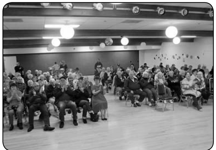
A good turnout for the District 8 jam at Woodburn.