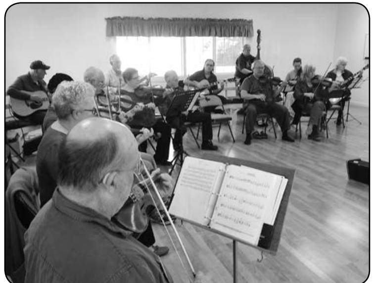
The District 6 intermediate fiddle class.