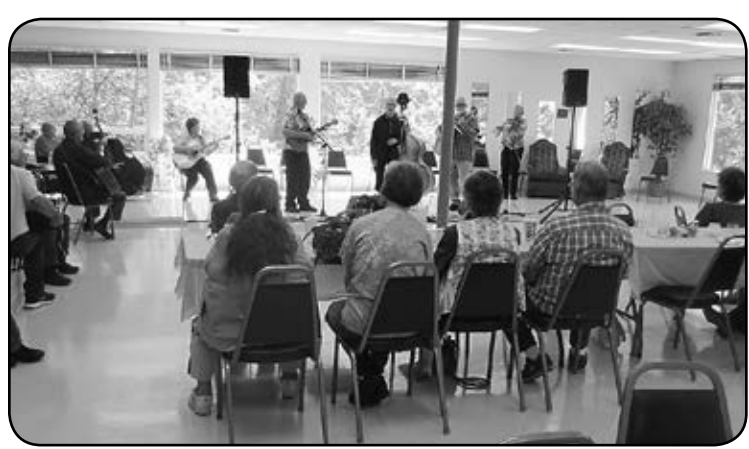
Estacada Community Center District 7 jam