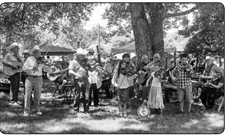
Dist 4: Children's Heritage Fair at Historic Hanley Farms

The Children's Heritage Fair at Historic Hanley Farms featured folks all ages having a wonderful time doing the "Virginia Reel". Our musicians got a real workout, as we did several sets, and got