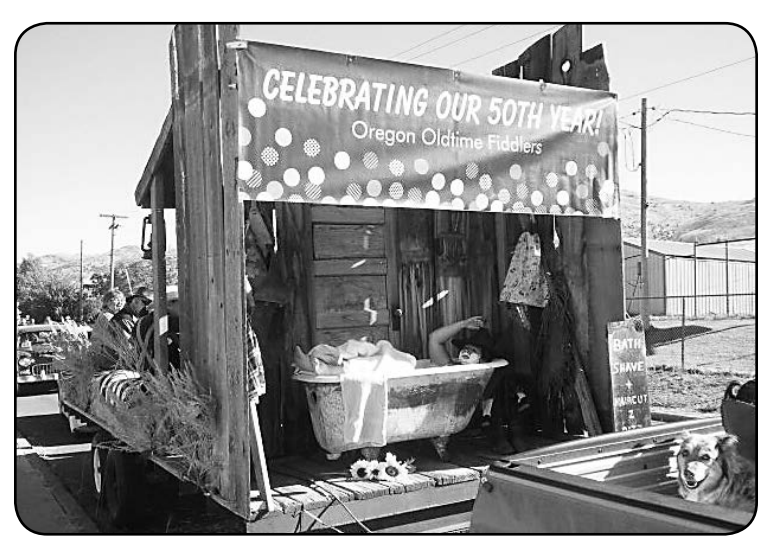
Front and back views of District 1E's float in the Lakeview Labor Day parade.