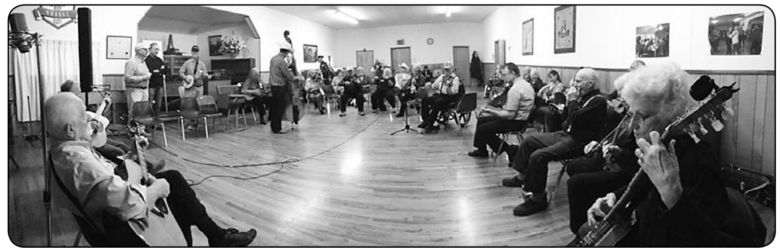
A panoramic view of the District 6 Thanksgiving jam.