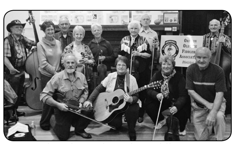
District 7 members at the new circle jam at the Estacada library.