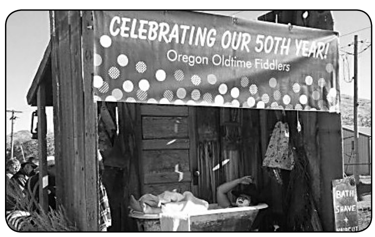
Why, of course: Sharilyn McLain!