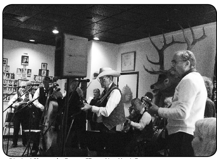
District 6 Plays at the Eugene Elks on New Year's Eve.