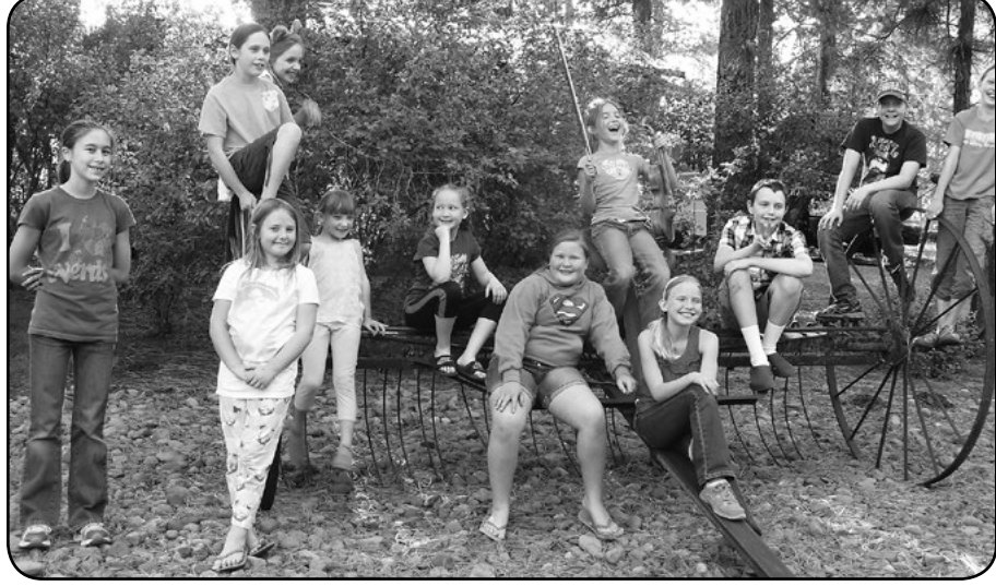
District 1 Junior Fiddlers at their barbeque in May!