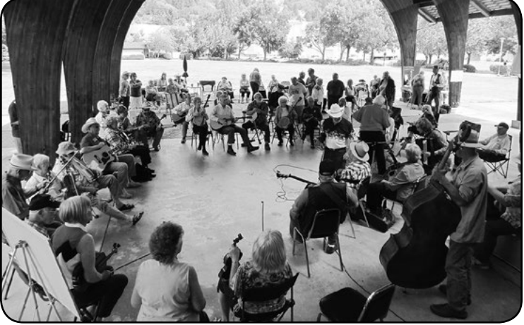
A great turnout and a beautiful venue for the National Treasures Celebration in Myrtle Creek