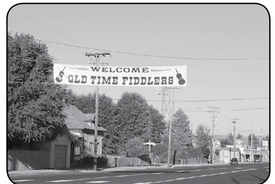
The city of Merrill made the OOTFA folks welcome!