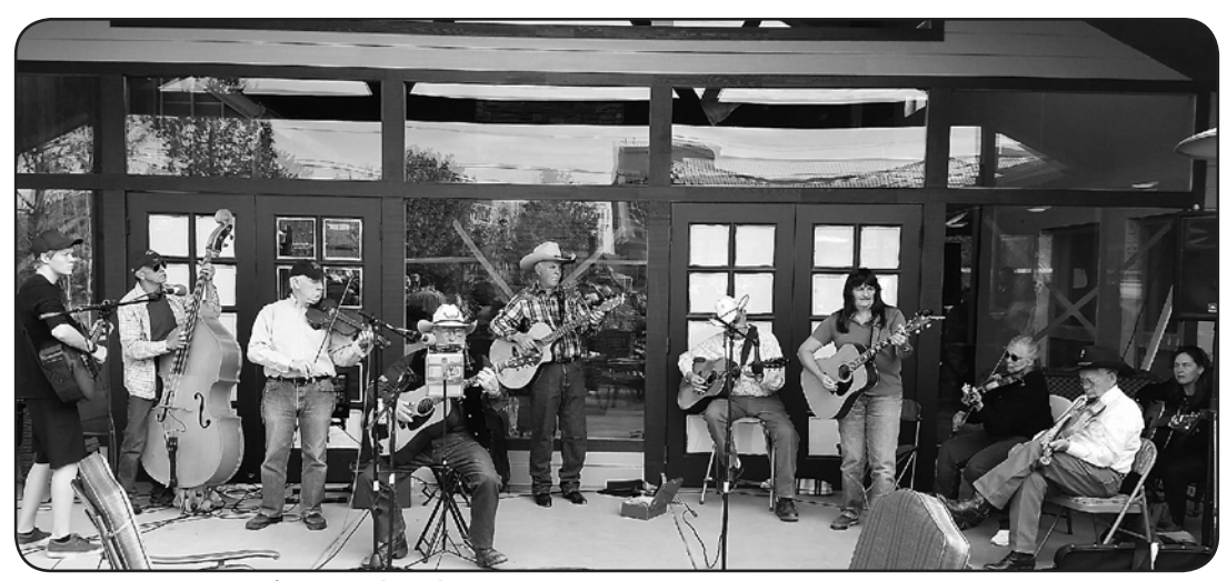
District 3 musicians perform in Redmond.