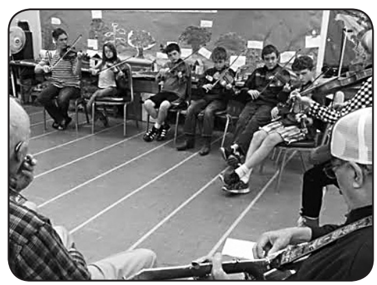
Young musicians taking a lesson with the old time fiddlers in Allegany