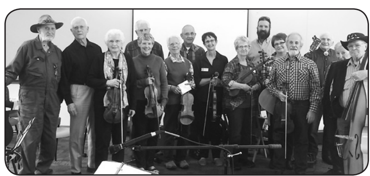
District 7 members after jamming at the Estacada Library circle jam