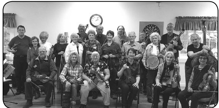
The District 6 fiddle class in December at River Road in Eugene