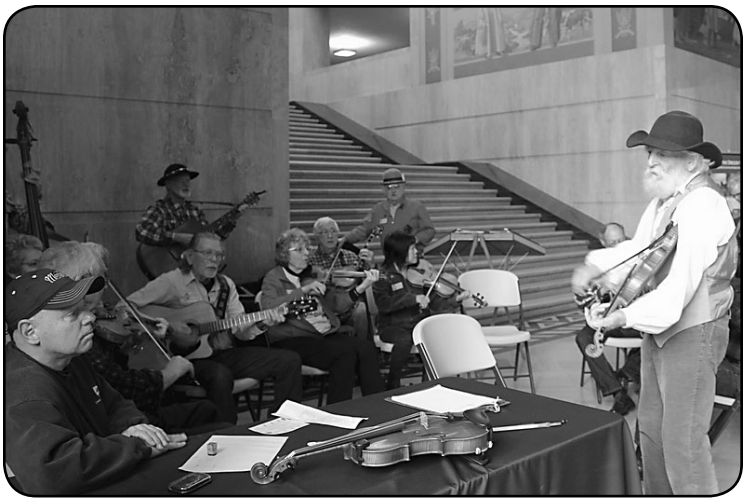
District 8 performs at Oregon's 157th birthday party in the rotunda of the state capitol.