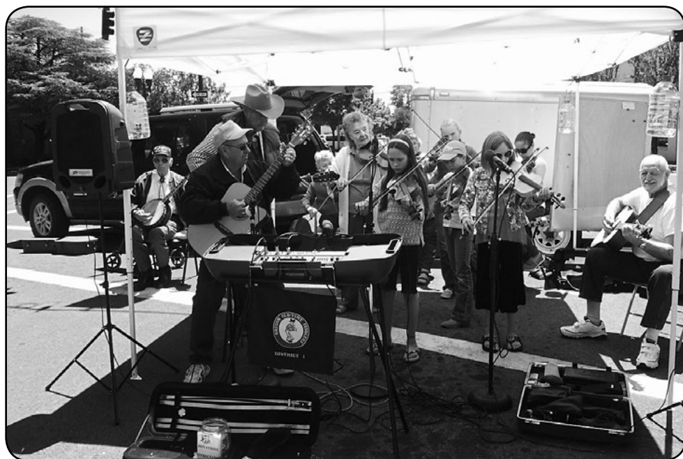
District 1 at the Farmer's Market.