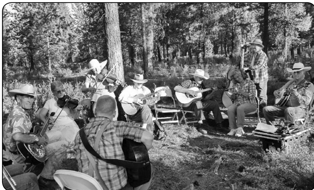
District 1 picnic -- District 1 news A great time was had by all.