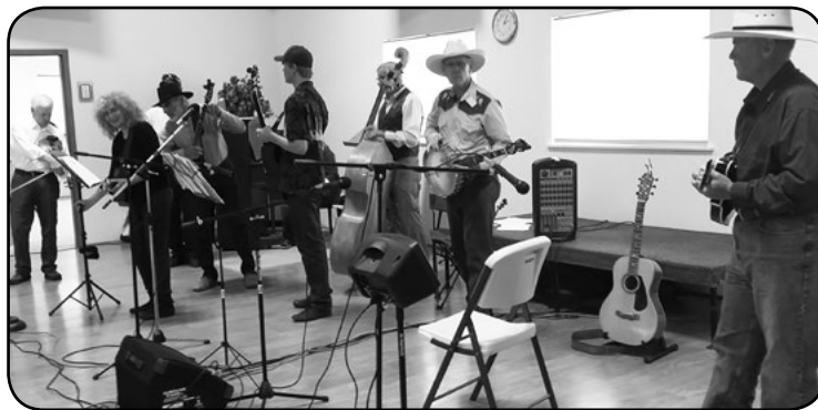
District 3: Birthday gig. A good time was had by all.