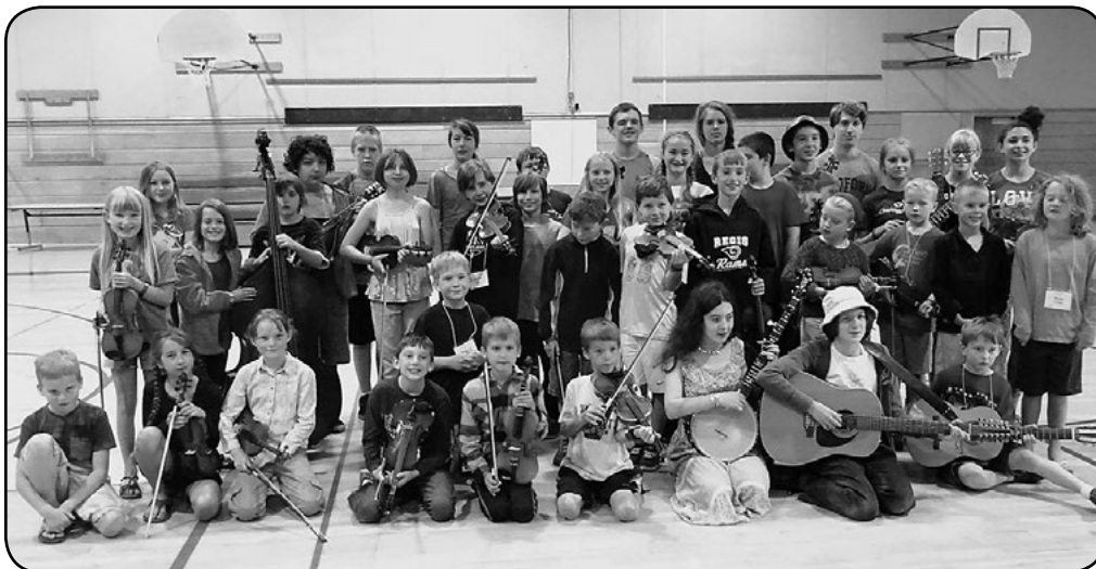
Young fiddlers on stage at Fiddle Camp