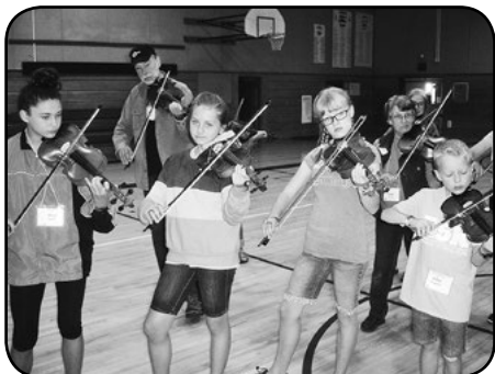
Young fiddlers perform at Fiddle Camp!