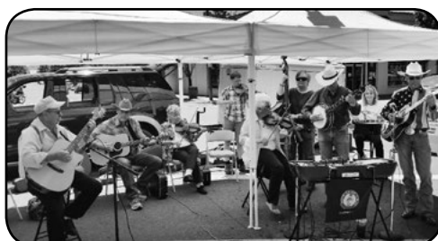
Fun times at the District 1 Farmer's Market