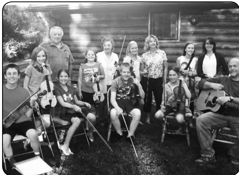
Junior fiddlers and teachers from District 1