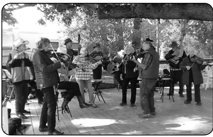
District 4 playing at the farm in Phoenix