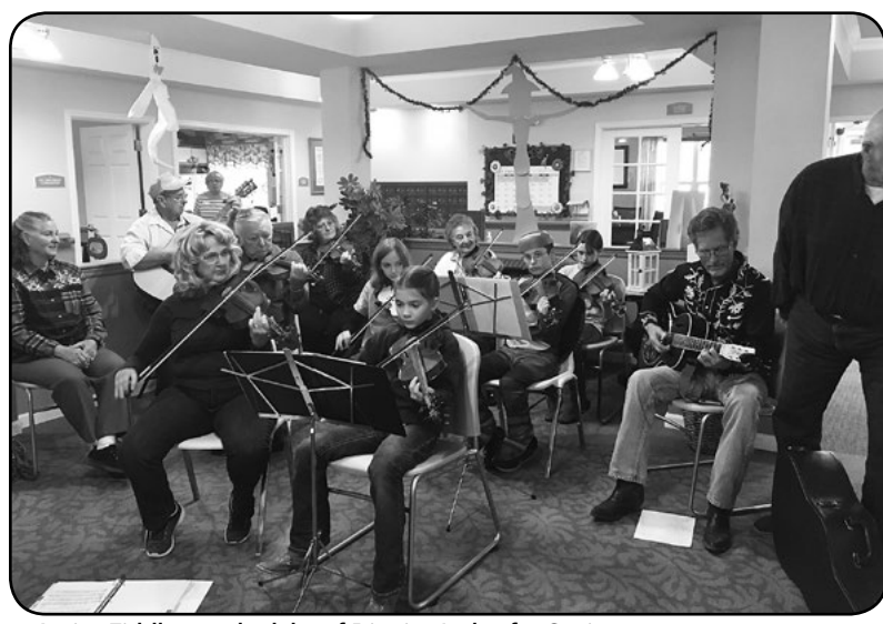
Junior Fiddlers and adults of District 1 play for Seniors