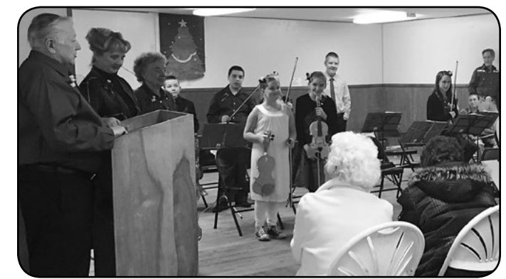
District 1 Junior Fiddler Christmas concert