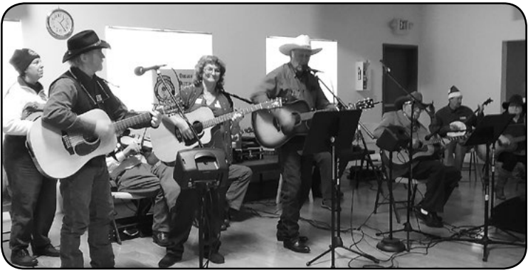
Music after the potluck, District 3