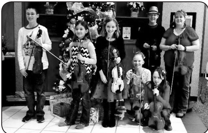
District One Junior Fiddlers perform at their Christmas concert.