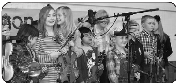
The kids opened the show on Friday night!