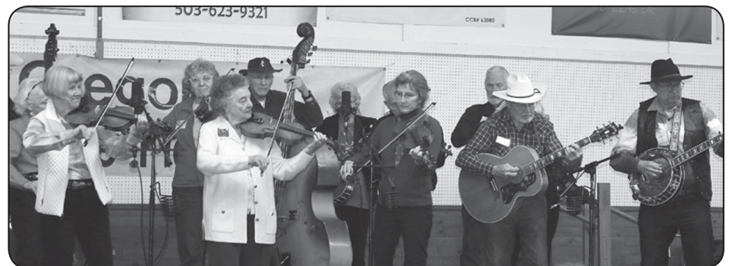
The last band of Friday night performing "I'll Fly Away"