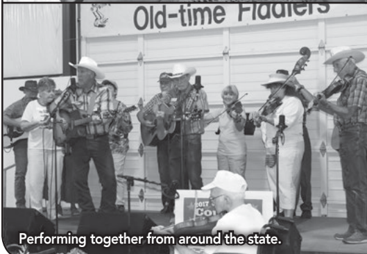
Performing together from around the state.