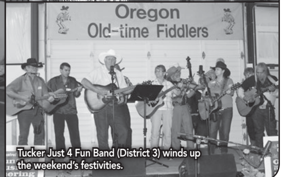
Tucker Just 4 Fun Band (District 3) winds up the weekend's festivities.