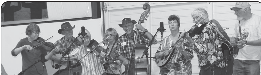
Fiddlers from all over Oregon jam on stage.