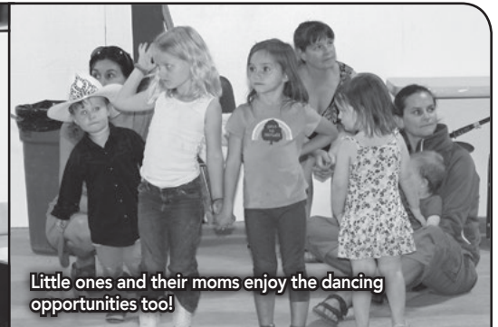
Little ones and their moms enjoy the dancing opportunities too!