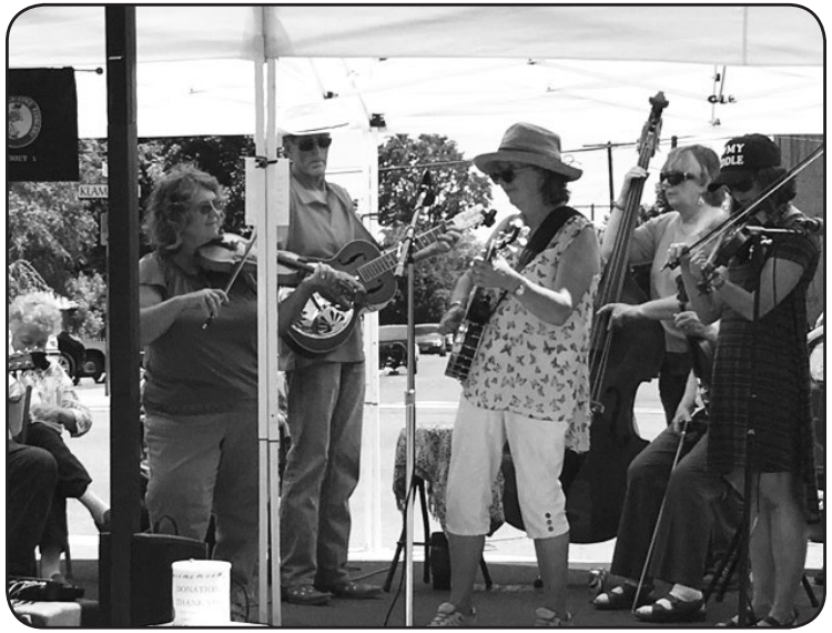
District 1 Farmer's Market gig