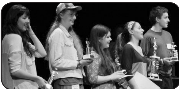
Contestants in 2015 with trophies!!!