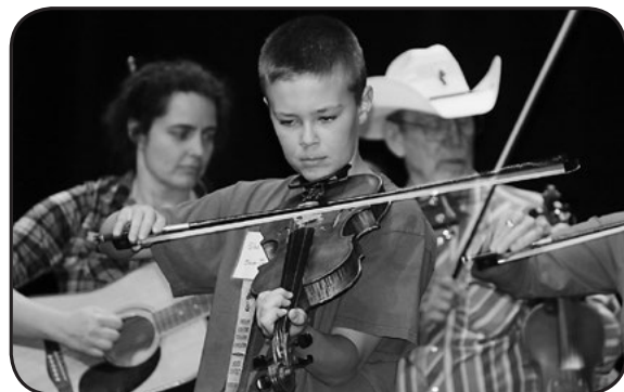
One of the 2016 contestants concentrating on his piece.