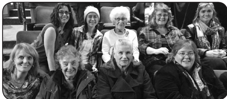
Some, but unfortunately not All....District 1 Ladies enjoying a night out to the Quebe Sisters concert at the Ross Ragland Theater.