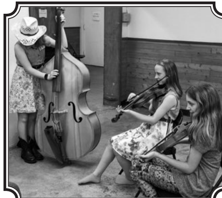
A kids' jam in Rickreall.