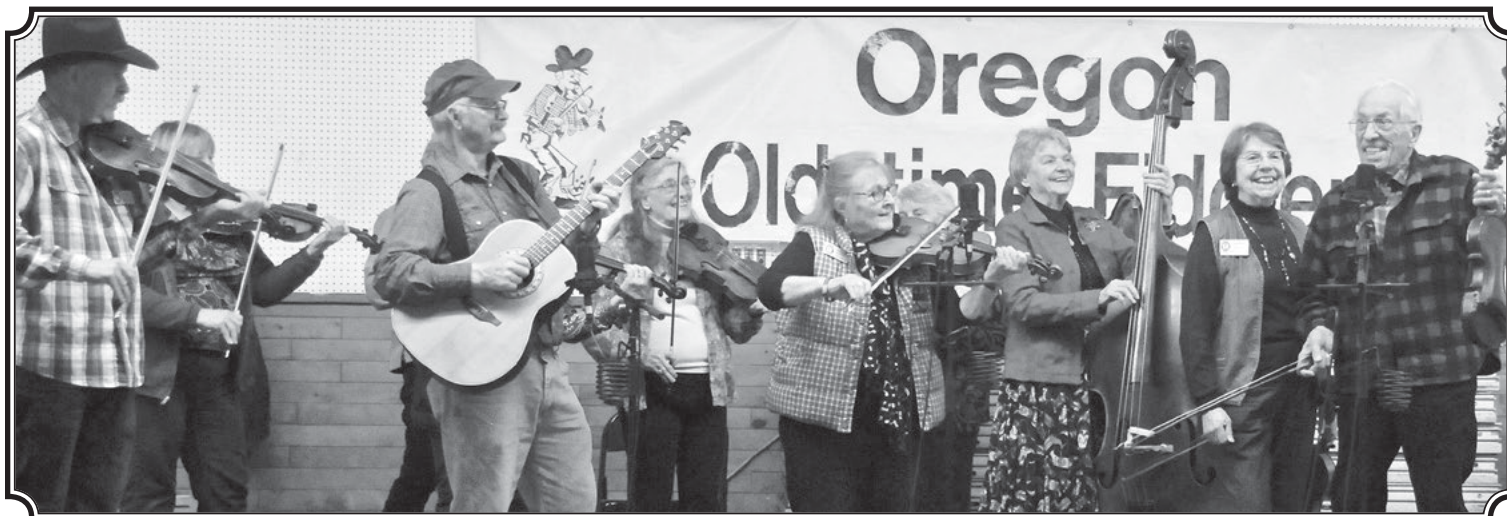
Musicians from all over Oregon