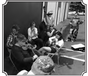
Silver Lake outdoor jams in the sunshine were enjoyed by all.