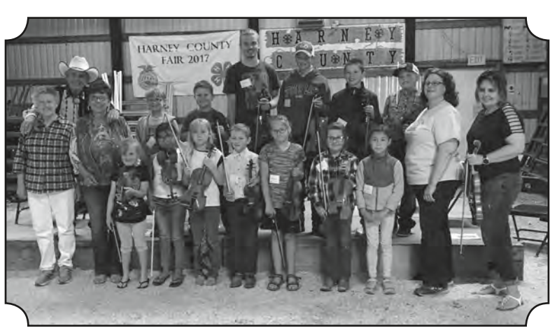
The Burns Junior Workshop learned lots and had fun too!