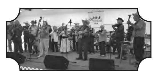
Friday night on-stage jam in Burns 2018