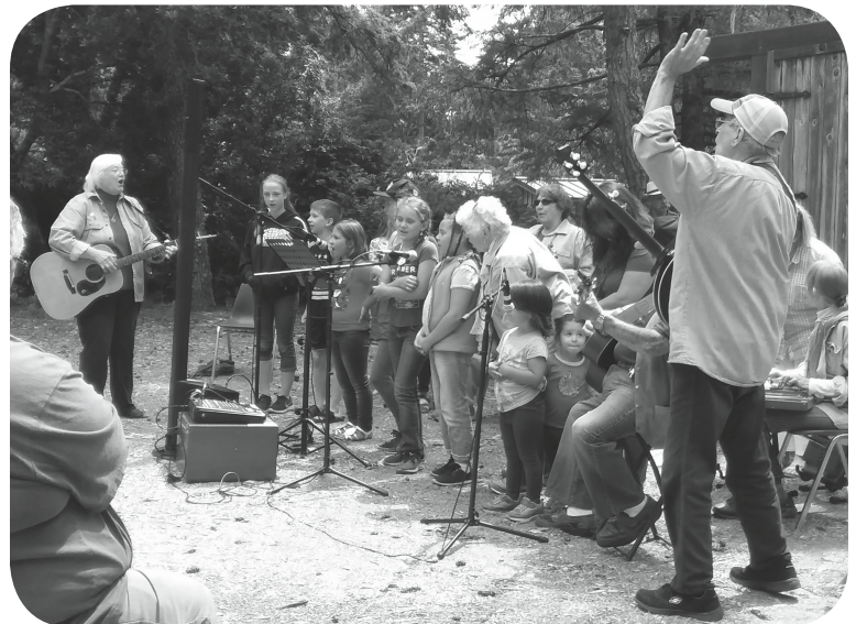
District 5 members gathering the children in the audience to sing "Jimmy Crack Corn" at Bullards Beach State Park.

what you love and sharing with others, I wish we had longer sessions as there are so very many dear old songs to sing.