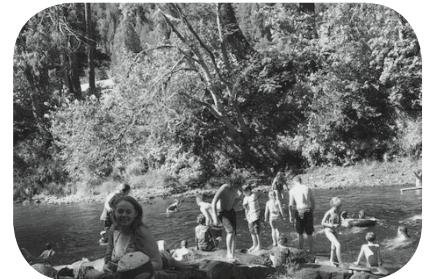
Swimming at a nearby creek (totally supervised by parents!)