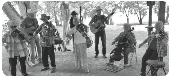
A small group of district 4 musicians at Hanley Farms on a Sunday afternoon.

Summer in District 4 has been a marathon of smoke-filled days with temps in the triple digits. Nights usually spent with windows open to the sounds of crickets, frogs and the occasional owl call are now spent listening to the A.C. unit pumping our dollars into the pocket of the power company. Our faithful musicians have valiantly faced the sometimes hazardous air to perform at our gigs and keep the patrons of our music entertained, even as a few members live in the fire zone.