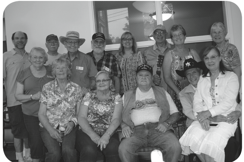
District 10 at an August performance.