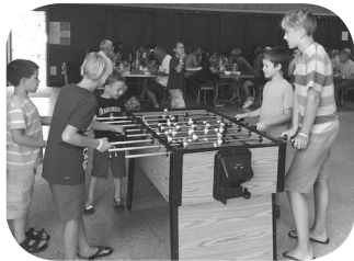
Foosball and new friends