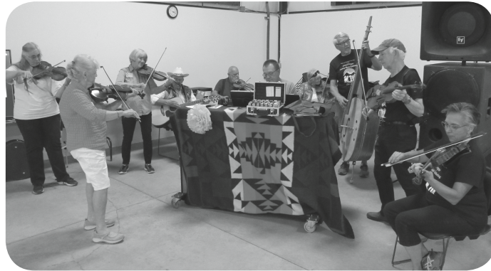
Lots of jamming in Prineville!!!