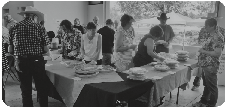
Pie and Ice Cream Social