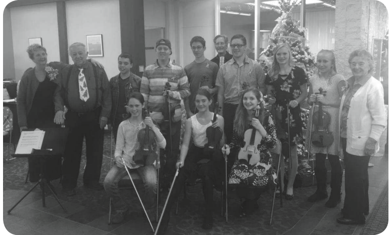
Junior Fiddlers and their teachers play at a Christmas gig for Umpqua Bank in Klamath Falls.

8 Junior Fiddler Practice 2-3 p.m. 13 meeting/jam Shasta Grange Noon - 3 p.m. 17 gig Pacifica 1-2 p.m. 22 Junior Fiddler Practice 2-3 p.m. 24 gig Crystal Terrace 11 a.m.- 12 p.m. 24 gig Rogue River Place 1-2 p.m. 26 gig Anthem House 1-3ish p.m.