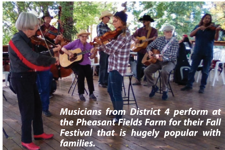
Musicians from District 4 perform at the Pheasant Fields Farm for their Fall Festival that is hugely popular with families.

to step up and serve in this volunteer position. If someone would bring the trailer each month, another member would set up the sound system. You don't have to be a musician to serve in any office or volunteer position, just be a member. This position does pay a stipend. Hopefully all members will consider stepping forward and serving to keep our district moving forward and strong.