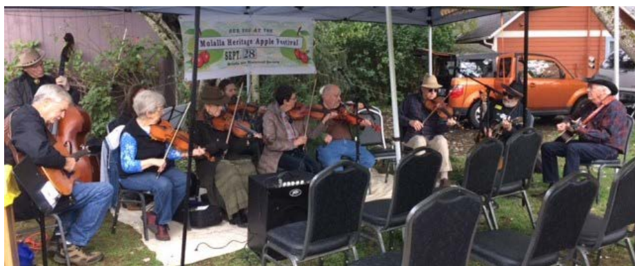
District 7 members at the Molalla Heritage Apple Festival

A day-long event on Saturday, November 2, 2019 held at The Tabernacle, in Turner, OR. Admission is $20 per person (18 and younger FREE) for the whole day from 11 am thru the evening. For more information contact the festival at armr2019@gmail.com See more information in the October Hoedowner.