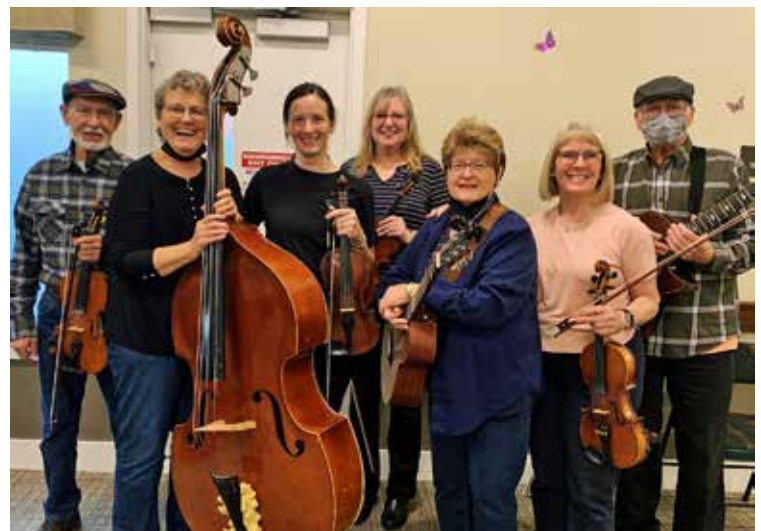
District 10 sure does like making beautiful music

Fiddling", "Learn to Play More Fiddle Tunes", "Twin Fiddling", "Christmas Fiddling", and "Old Time Fiddle Tunes Our Dads Played". All have music notation, fiddle tablature, accompaniment chords, and CD with all tunes played at a moderate tempo. Info: www.LudikerMusic.com , call (509) 927-7529 or email jaydean1@earthlink.net .