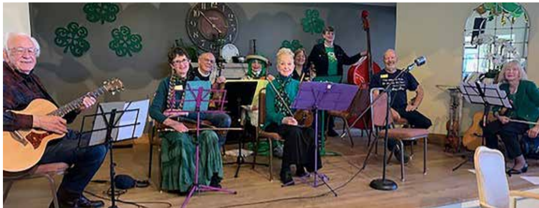
District 7 members getting their Irish up at Cascade Inn Assisted Living Center