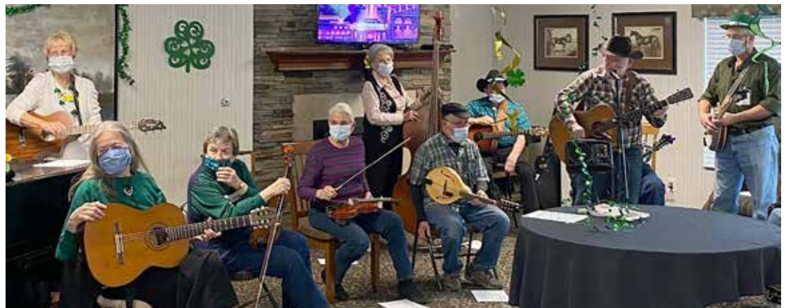
District 8 musicians at Jefferson Lodge in Dallas on March 17th