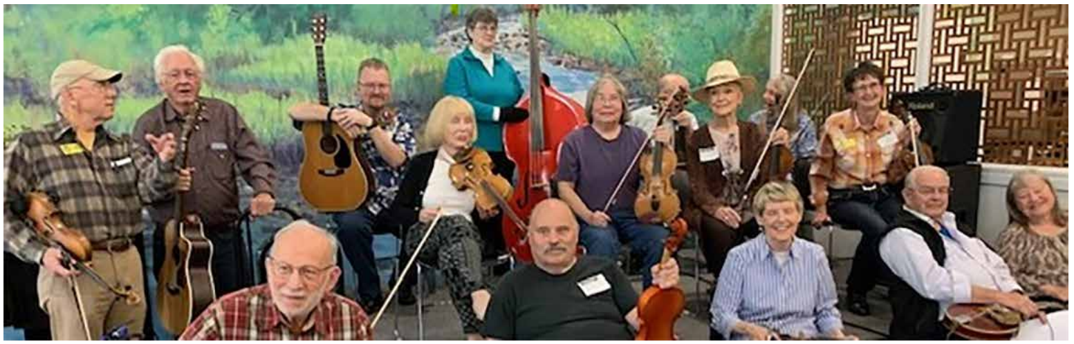
District 7 group gig at Portland's Cherrywood Village