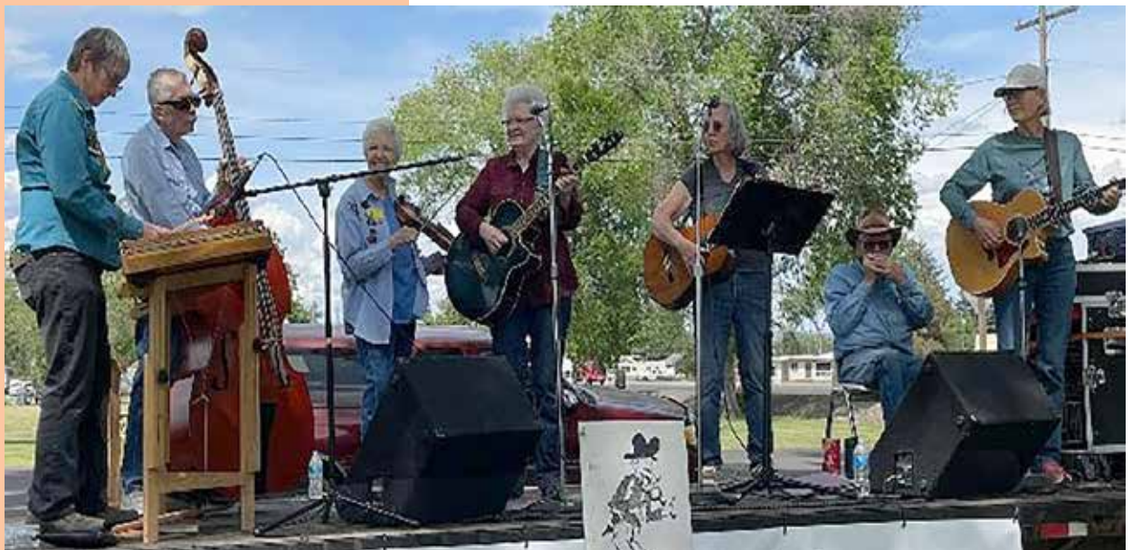
District 9 played for the Archeology and Culture Keepers Road Show on June 24th