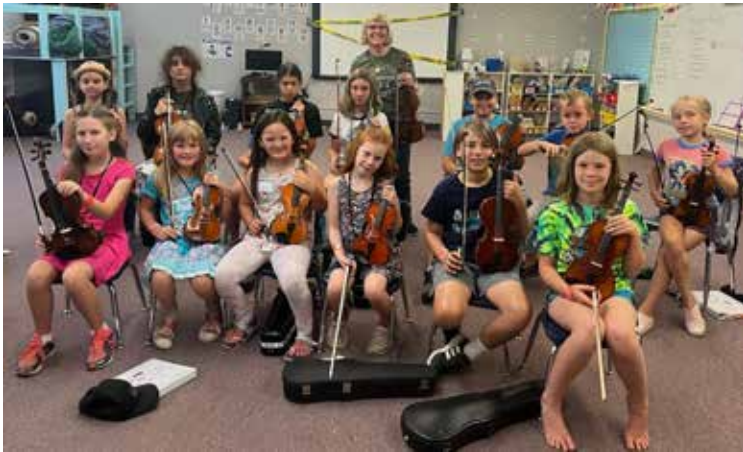
Beginning Youth Fiddle Class, the future hope and success of OOTFA

Once again, Emerald Christian Academy in Pleasant Hill proved to be a great facility for the camp and the showers even have hot water (those who came to West Fir will get it). After cleanup on Thursday, the ice cream Sundays were a great way to send our camper's home. We should have a few pictures posted to the website during the next couple of weeks, so take a look at Fiddlecamp.net .