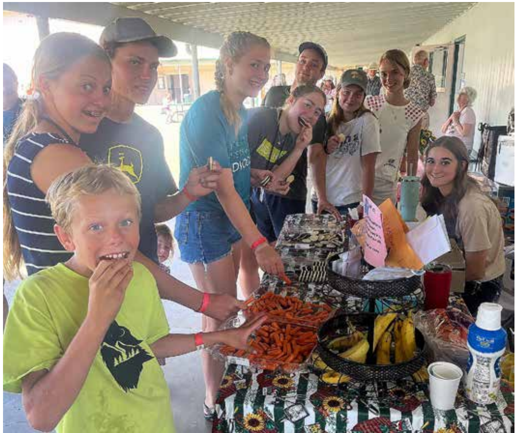
Fiddle Camp takes a lot of energy and these young participants need their snacks!