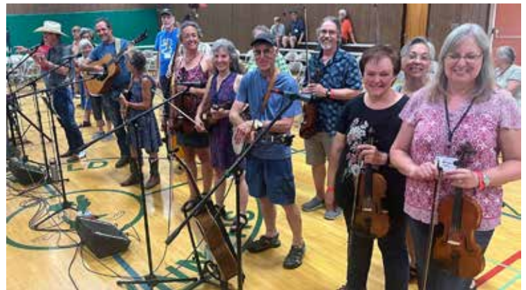
Lots of smiles at Fiddle Camp