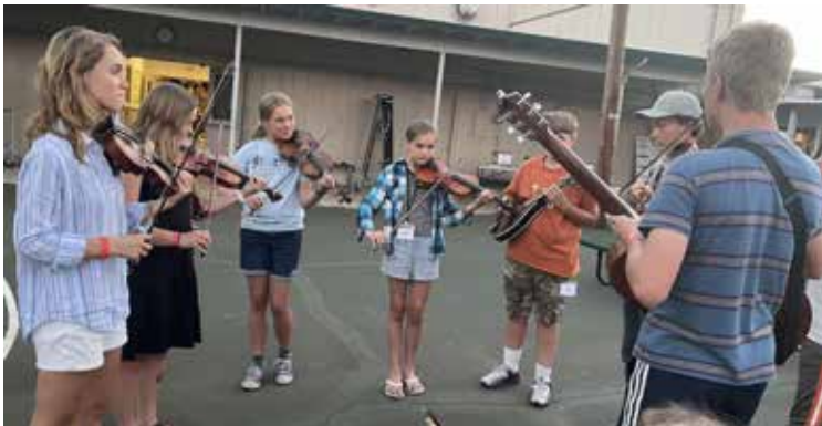
Young musicians working out some tunes together