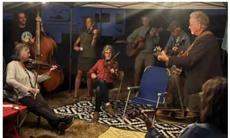
Night jam at camp